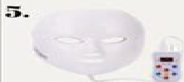
LIGHT THERAPY MASK