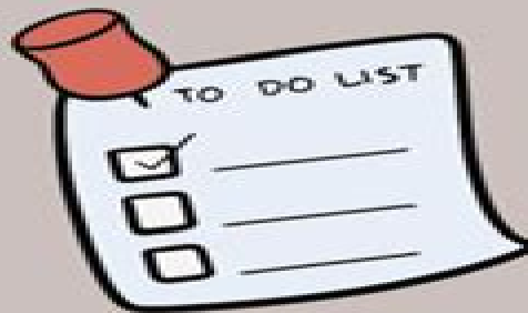
top priority to do list