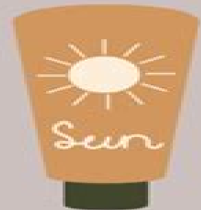
go out for fresh air