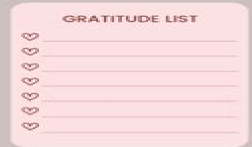
5 minute journal