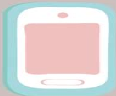
go screen free for 30 minutes