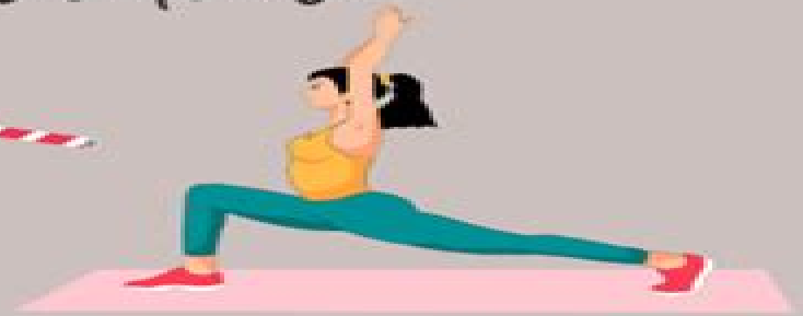
10 minute stretch