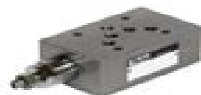
Parker ZDR Pressure Reducing Valve, Pilot Operated