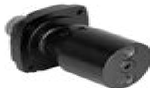
Parker R1E02 Pressure Relief Valve, Direct Operated