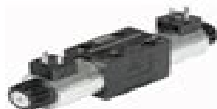
Parker D3FB Directional Control Valve