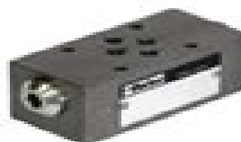
Parker ZRE Check Valve - Pilot Operated