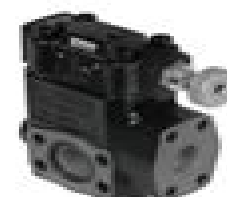
Parker R5U Pressure Unloading Valve, Pilot Operated