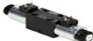
Parker D1FB Directional Control Valve