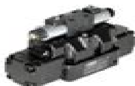
Parker 4D02V / 4D03 / 4D06 Directional Control Valves