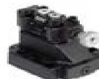
Parker R4R Pressure Reducing Valve, Pilot Operated Subplate Mounting