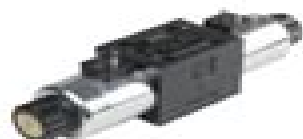
Parker D3W Series Directional Control Valve