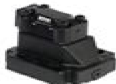
Parker C4V Check Valve - Direct / Pilot Operated