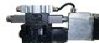
Parker Hydraulic Servo & Proportional Valves