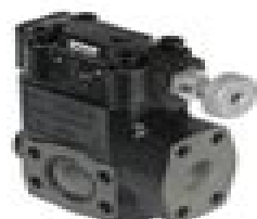
Parker R5V R5V*P2 Pilot Operated Pressure Relief Valves, SAE Flange