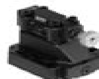
Parker R4V R6V Valves - Subplate Mounting