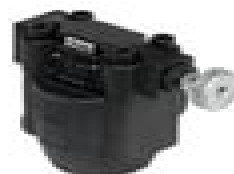
Parker R4V R4V*P2 Inline Pilot Operated Pressure Relief Valves