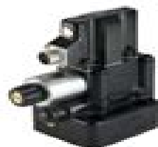
Parker R4V / R6V OBE Pilot Operated Pressure Relief Valves