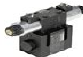
Parker D31DW, D31NW, D41VW, D81/91VW, D111VW DC Valves