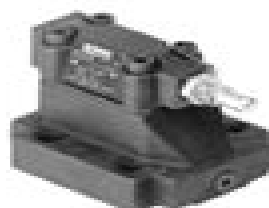
Parker R4V / R6V TUEV Pilot Operated Pressure Relief Valves