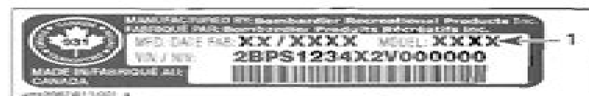
1. Model number

The Vehicle Model Number is scribed on vehicle description decal.