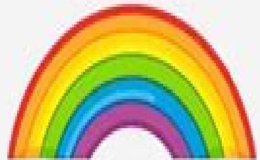
Shape of a rainbow