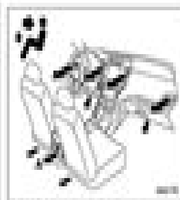
1. Models with rear ventilators

Ventilation: Instrument panel outlets and foot outlets