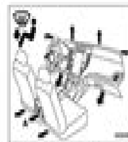
4. Models with rear ventilators

Heat: Foot outlets, both side outlets of the instrument panel and vents through wind-shaped outdoor outlets (a small amount of air flows to the windshield and both side windows to prevent fogging.)