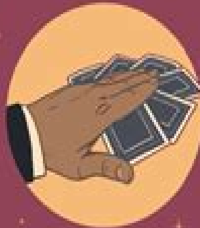
The Magnetic Hand