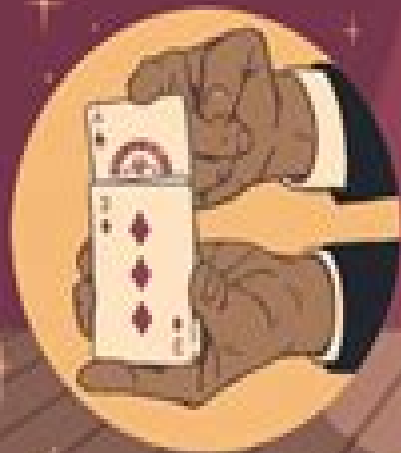
The Rising Card