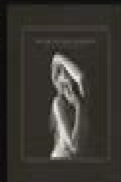
THE TORTURED POETS DEPARTMENT Taylor Swift