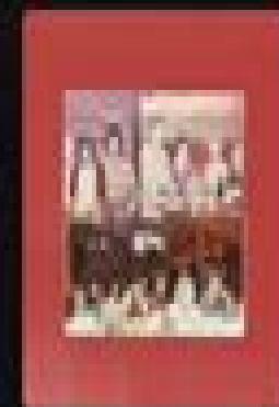
The Great American Bar Scene Zach Bryan