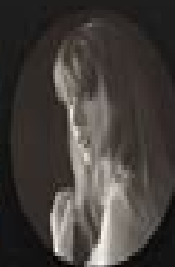
Taylor Swift Artist