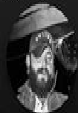
Post Malone Artist