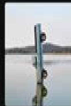
F-1 Trillion Post Malone