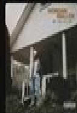
One Thing At A Time Morgan Wallen