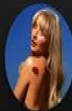
Sabrina Carpenter Artist