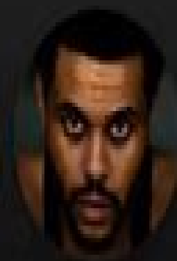
The Weeknd Artist