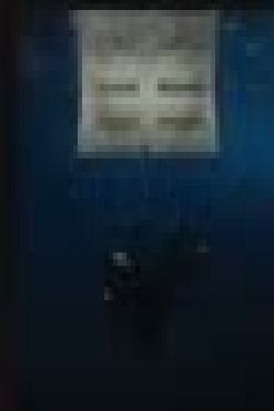
HIT ME HARD AND SOFT Billie Eilish