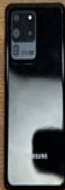
Galaxy S20 Ultra