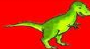
البراكسورس وركس Tyrannosaurus Rex