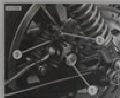
Figure 1-15. Rear Brake Caliper