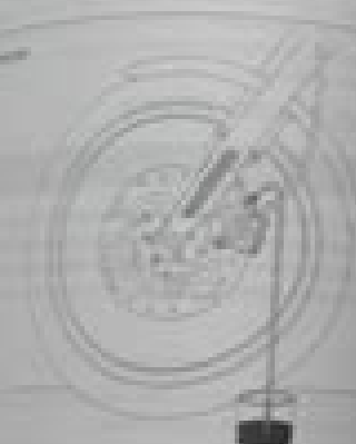
Figure 1-13. Bleeding Hydraulic System

1. If the motorcycle is equipped with dual front disc brakes, repeat the procedure for other caliper.