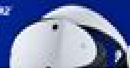
PlayStation 5 Console Required