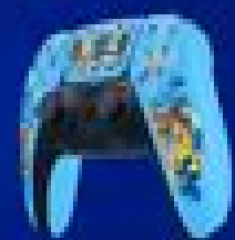
Fortnite Limited Edition DualSense™