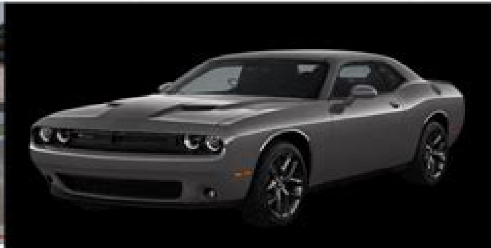
Dodge Charger EV