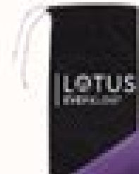
lavender eye pillow