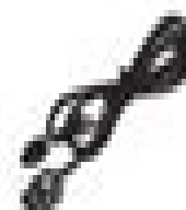
USB cable (CB-USB8)

Other accessories not shown: Warranty card Contents may vary depending on purchase location.