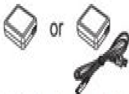
USB-AC adapter (F-2AC)