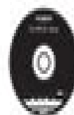
OLYMPUS Setup CD-ROM