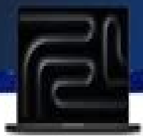
Select MacBook Pro (M4) models