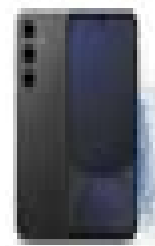
Select Samsung Galaxy S24 FE 128GB unlocked phones