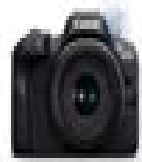
Canon EOS R50 4K video mirrorless camera with RF 18-45mm F4.5-6.3 IS STM lens