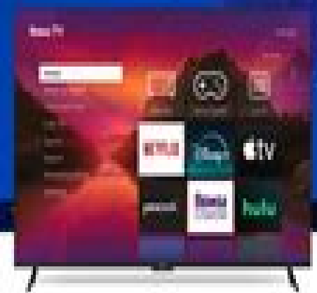
Roku 65" class Select Series 4K smart TV