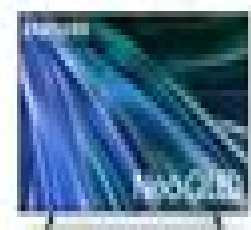
Samsung 65" Neo QLED 4K smart TV