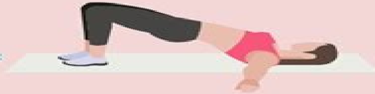
2. PILATES BRIDGE