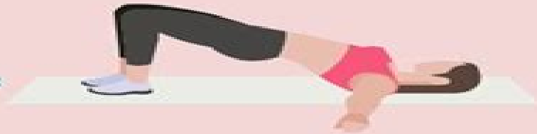
2. PILATES BRIDGE