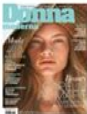
Donna Moderna – 4 Luglio 2024