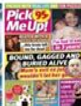
Pick Me Up! – 11 July 2024