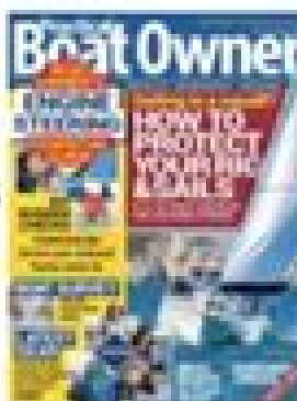
Practical Boat Owner – August 2024