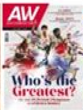
Athletics Weekly – July 2024