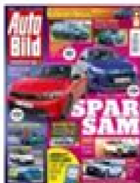
Auto Bild Germany – 4 Juli 2024

We try our best to present you the most recent issues of magazines. Also at our site you can check out the newest 50 issues added for you read at our best resource of magazines. You can also use page navigation at the bottom of the page to find magazines that were added earlier in the order of their appearance on the site. You can easily download the magazine into your android tablet or ipod iphone ipod and enjoy reading it at any time