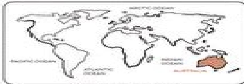
Kangaroos live in Australia.

There are some types of kangaroos that are endangered or extinct. Scientists say some kangaroos are in danger because there is a change in climate.