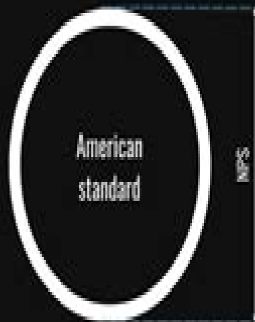
Nominal Pipe Size