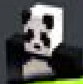
(1.0 P.) Avatar By Robo $129