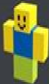
(1.0 Noob) Pixel Avatar By RobotGentleman $119 ($1.34)