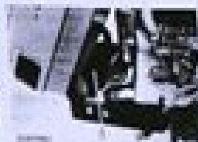
(1) Ignition System (2) Ignition Timing (3) Fuel (4) Fuel (5) Ignition (6) Ignition (7) Fuel (8) Fuel