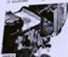
(3) Disassembly (4) Assembly