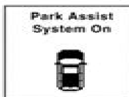
Park Assist System ON

When the vehicle is in REVERSE, the warning display will turn ON indicating the system status.