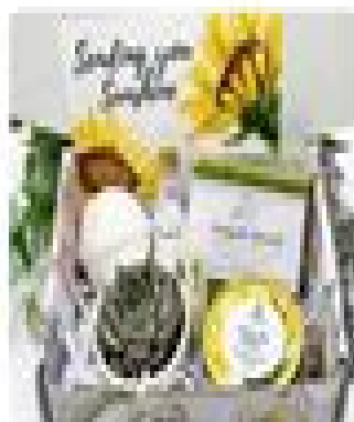
Thinking of You - Succulent Gift Box - Missing You - Friendship...