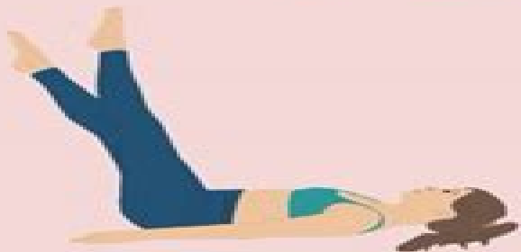
5. THE HUNDRED