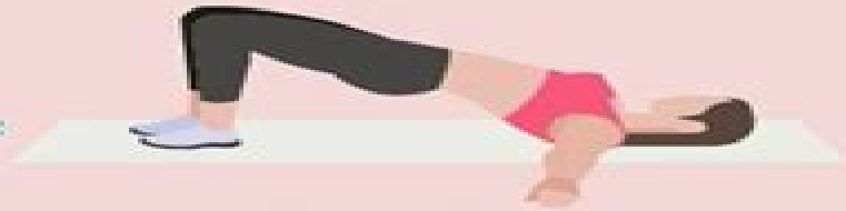
2. PILATES BRIDGE