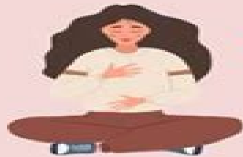
1. WARM-UP: PILATES BREATHING