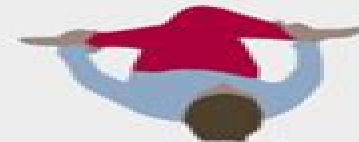
RECLINING COW FACE