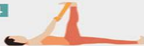
RECLINING HAND TO BIG TOE