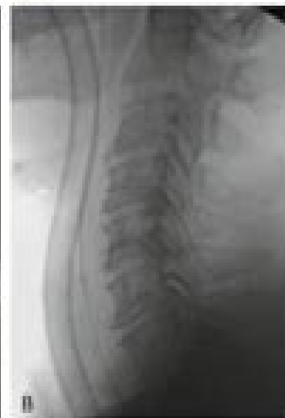
FIGURE 8.1 (A) Anteroposterior and (B) lateral radiographs.