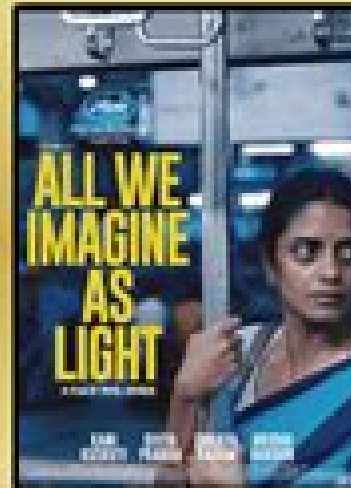
All We Imagine as Light (Janus Films)