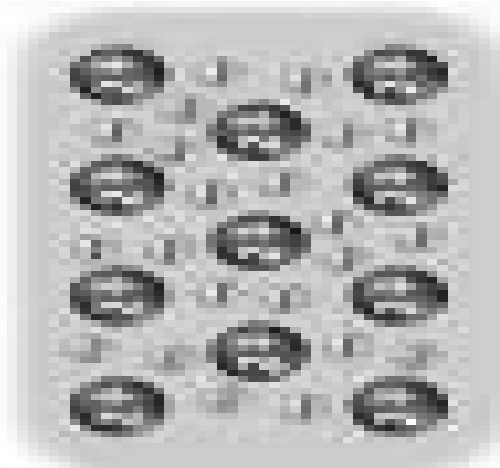
Group 1 Metal Atoms