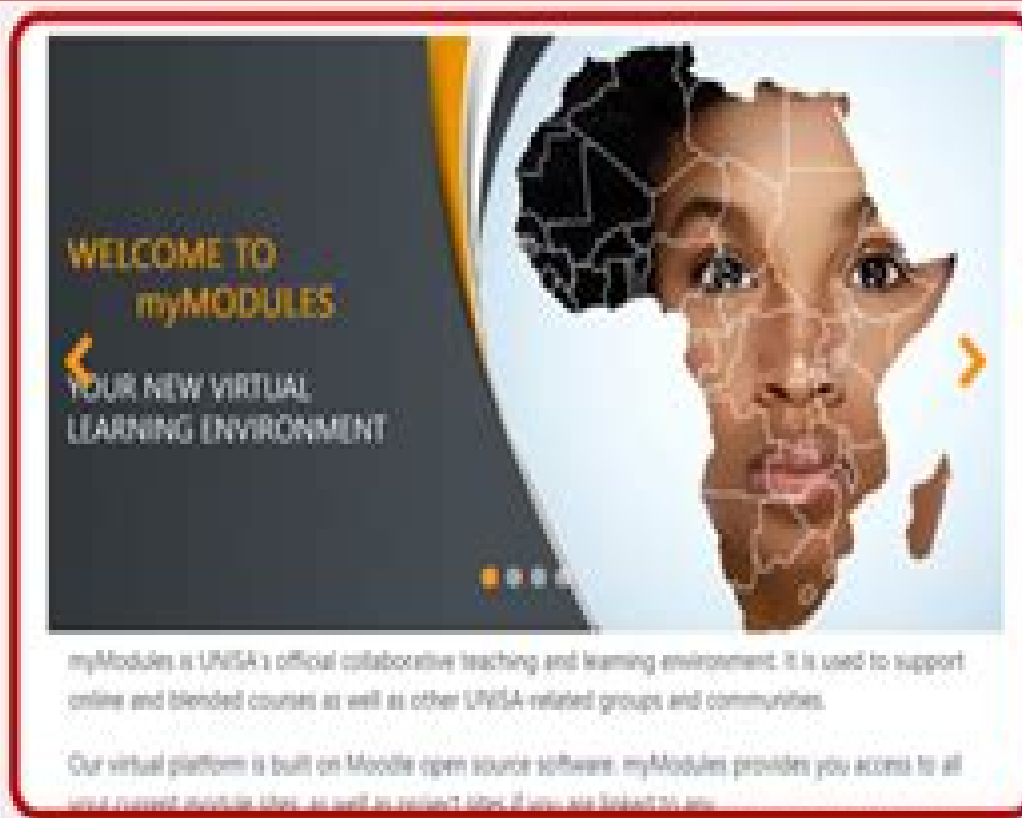
Main content area.