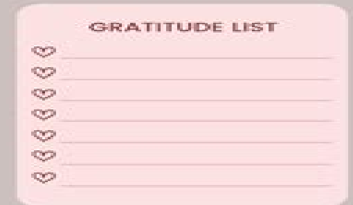
5 minute journal