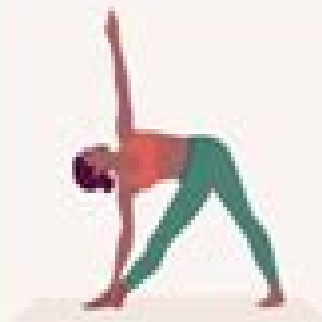
Extended Triangle Pose