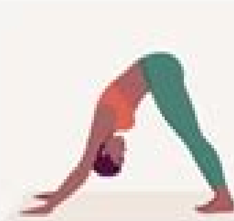
Downward Facing Dog