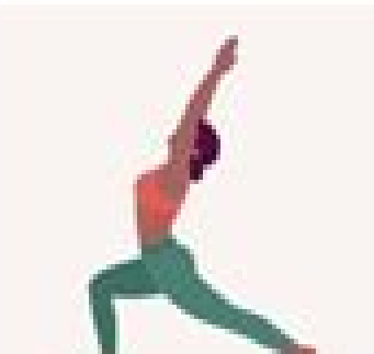
Warrior 1 Pose