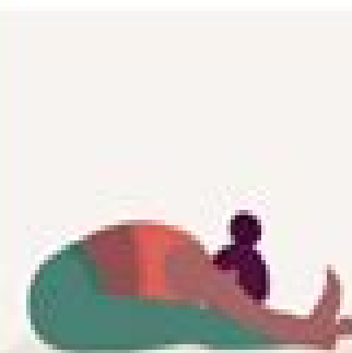
Seated Forward Fold