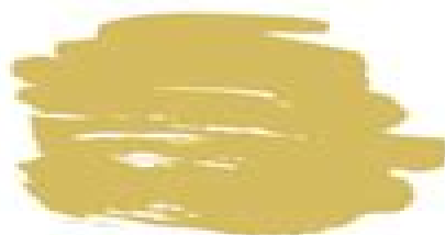
Cadmium Orange Hue