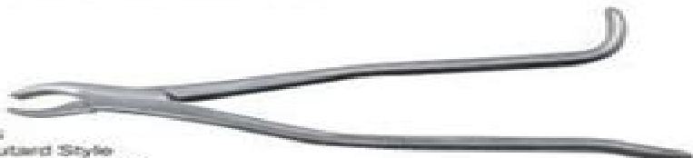
616 Liautard Style Forceps 10" S.S