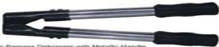
604 Rasp Barners Dehorners with Metallic Handle and also available in wooden handle