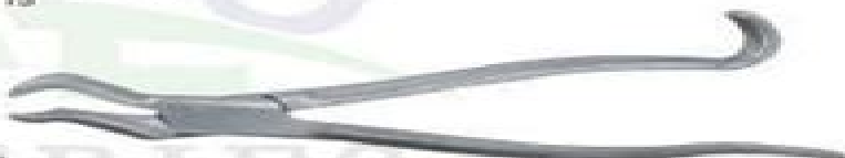
615 Incisor Forceps, 10"