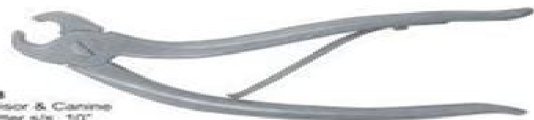
608 Incisor & Canine Cutter s/s, 10"