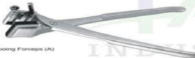
607 Tattooing Forceps (A)