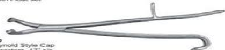
610 Reynold Style Cap Extractors, 17" s/s