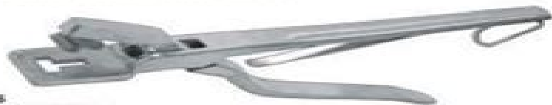
605 Ear Notcher S.S Design in the Center of the ear