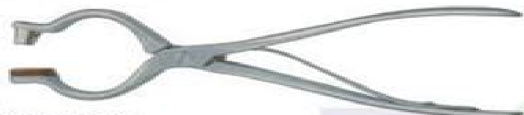
606 Ear Notcher - A-type