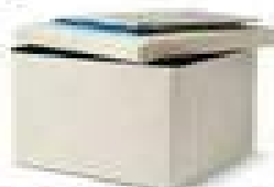
KIRKTON HOUSE Foldable Storage Organizer