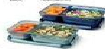
KIRKTON HOUSE Expandable Container