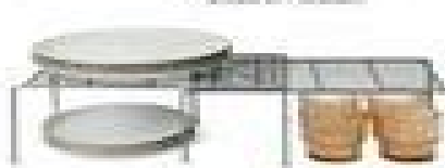
KIRKTON HOUSE 2-Pack Cabinet Shelves • Small or Medium