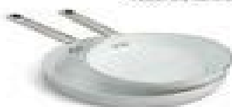
KIRKTON HOUSE Ceramic Frying Pan • Assorted Varieties