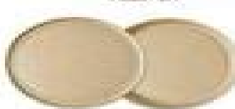
KIRKTON HOUSE Double-Sided Placemat