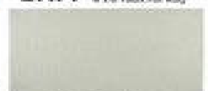
KIRKTON HOUSE 4' x 6' Faux Fur Rug