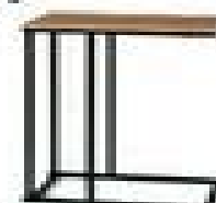
KIRKTON HOUSE Sonic Couch Table