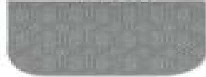
KIRKTON HOUSE 20" x 34" Kitchen Accent Rug