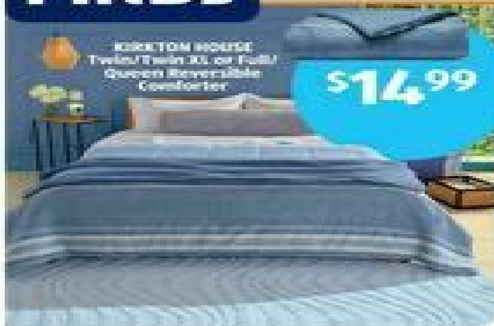
KIRKTON HOUSE Twins/Twin XL or Full/Queen Reversible Comforter

Unexpected products at amazing prices. Get 'em while they last.