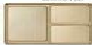
KIRKTON HOUSE 4-Piece Bakeware Set