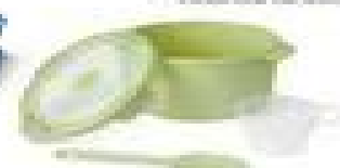
KIRKTON HOUSE Cookware • Assorted Varieties