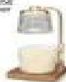
KIRKTON HOUSE Candle Warmer Lamp