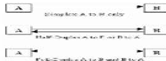
Fig. 3 different types of serdes cores

SerDes cores which contain only transmit or only receive channels are called simplex cores; SerDes cores which contain both transmit and receive channels are called full duplex cores. Note that the terminology "full duplex" does not imply that the electrical interface is bidirectional. Any given electrical interconnect channel has a fixed direction of data transmission. If a protocol application requires "full duplex" communication, then independent transmit and receive channels with independent interconnections are used to implement the interface.