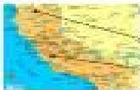
The Southern Pacific Railroad system

During the 1840s, the first railroads were built in the West. They were built by private companies. They were built to connect the West to the East. They were built to make it easier for people to travel and for goods to be transported. The first railroad in the West was the California Foothill Railroad. It was built in 1843. It connected San Francisco to the East. It was a symbol of progress and a new way of living.