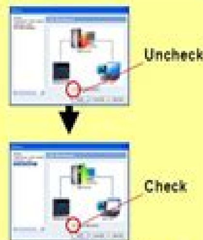
Option – PBX Web Manager