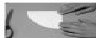
Figure 2a, 2b: Fold the paper circle in half, and then in half again.

Customer Support (800) 676-1343 E-mail: support@telescope.com