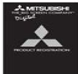
Product Registration Card