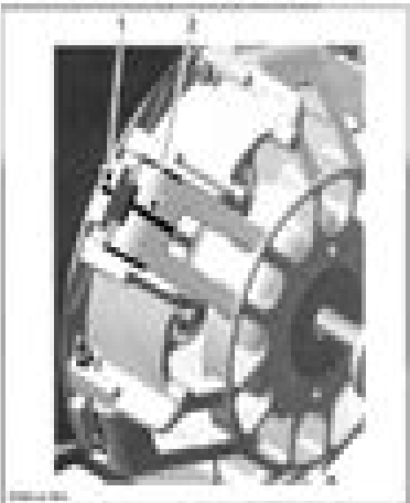
1. Mark on drive pulley locking bolt 2. Mark on governor cup

CAUTION: Prior to removing the drive pulley, mark sliding rail and governor cup together to ensure correct reinstallation. There are only 4 ways mounted out of 8 possible positions.