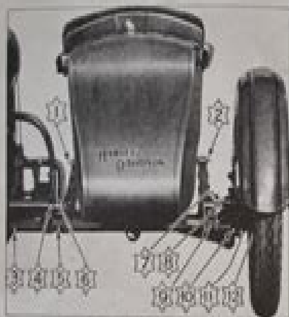
View, Rear Section and Rear Wheel Assembly