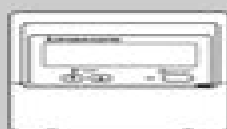
WIRED REMOTE CONTROLLER