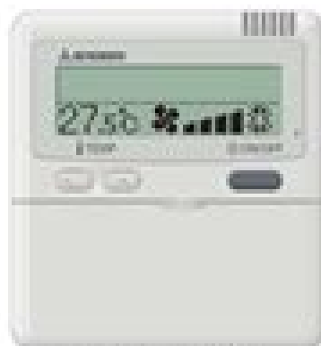
«WIRED REMOTE CONTROL» RC-E3