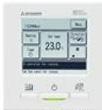
«WIRED TOUCH REMOTE CONTROL» RC-E3X series