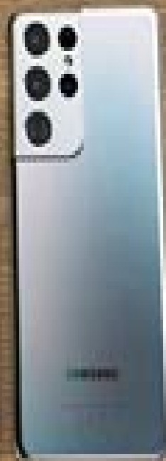
Galaxy S21 Ultra