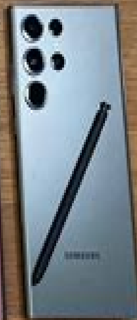
Galaxy S23 Ultra