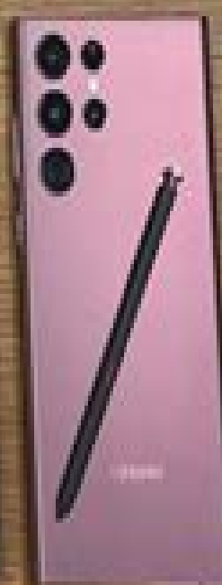
Galaxy S22 Ultra