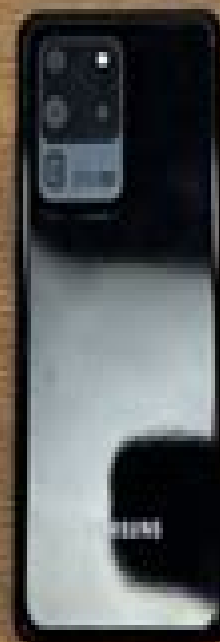
Galaxy S20 Ultra