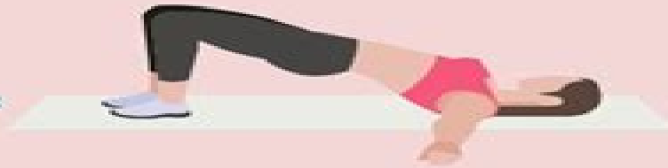
2. PILATES BRIDGE