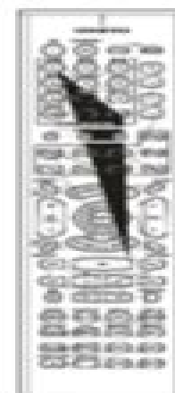
AC-SW1 or AC-SW1M