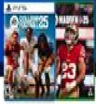
EA College Football 20 or Madden NFL 20