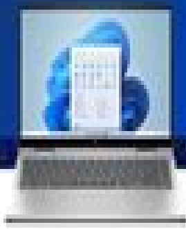
HP Elite 2-in-1 14" Full HD touch-screen laptop with an Intel® Core™ i7 processor and 500GB SSD