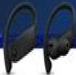
Beats Powerbeats Pro wireless earbuds in black