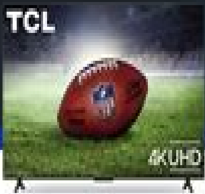
Only at Best Buy TCL 65" class P-Series 4K smart Fire TV

My Best Buy Plus and My Best Buy Total members get Early Access on Nov. 21.