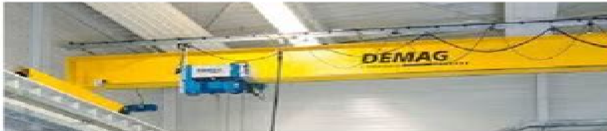
Representative image of monorail beam.

A study of global and local resistance must be carried out on the lower wing on which the hoist rests, as well as the vertical deformation that said beam may have must also be verified.